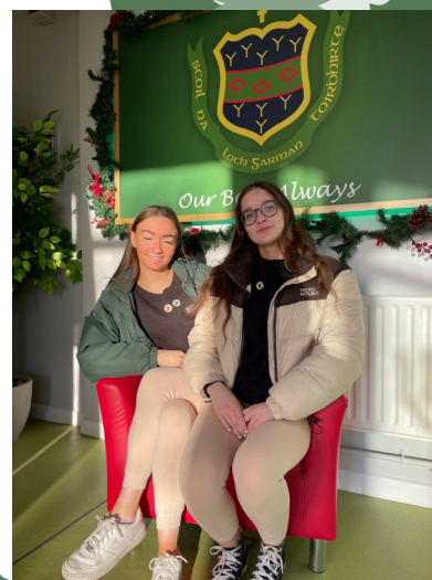
Second year students who recently received their positive behaviour badges