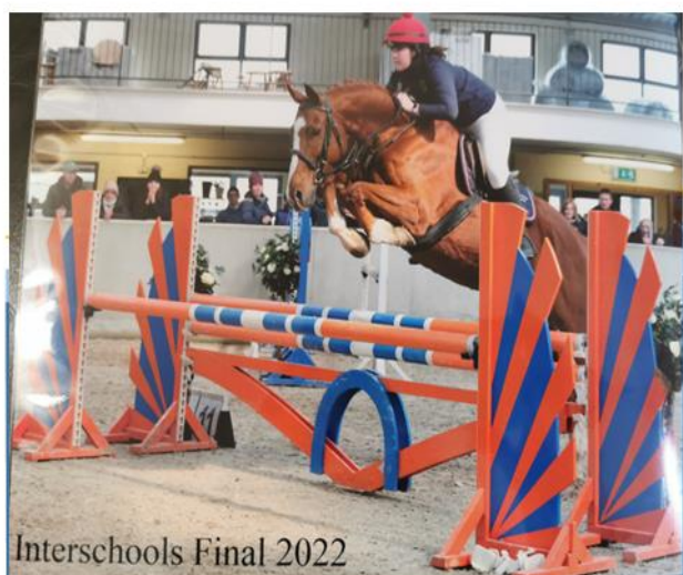
Interschools Final 2022