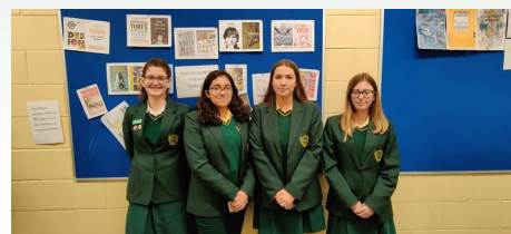
Junior Problem Solvers! Some of the students who represented the school at St Leo's College, Carlow this term.

Welcome to the first edition of the Presentation Newsletter of the calendar year. The hint of a stretch in the evenings heralds the impending arrival of the Mock examinations and we wish our 3rd & 6th Year students all the very best with their upcoming tests. Enjoy!