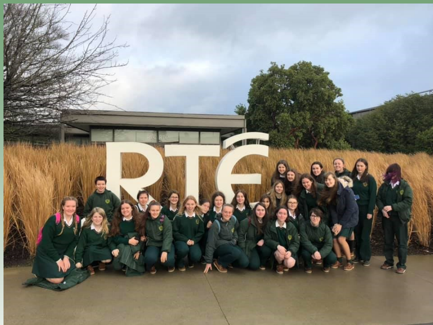
Transition Year Journalism students pictured outside RTÉ studios after a tour of the Donnybrook Campus recently.