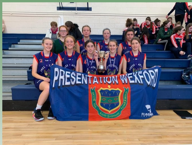
Our U16 South East Champions