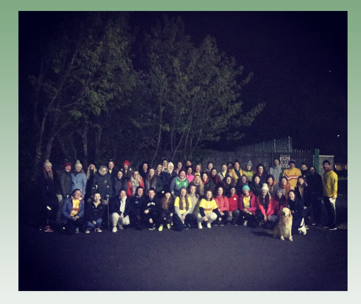
Well done to our 6th Year group who took part in the Darkness into Light walk to raise funds for Pieta House this term.