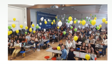
Our 6th Year Group all set for their Future Wish Ceremony

Welcome to the final edition of the Presentation Newsletter for the 2018/19 academic year. We would like to wish all students sitting the State exams the very best of luck as we say goodbye to the class of 2019.