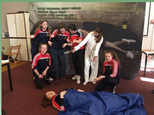
2nd Year students during their CSI Workshop in Science this term.