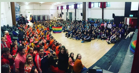
Presentation Wexford Celebrates LGBTQI+ week, raising funds for BeLong To Youth Services.