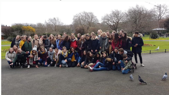
Our French Exchange students pictured at St. Stephen's Green on their recent visit.