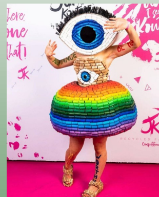
Beauty is in the Eye of the Beholder qualify for Junk Kouture Finals