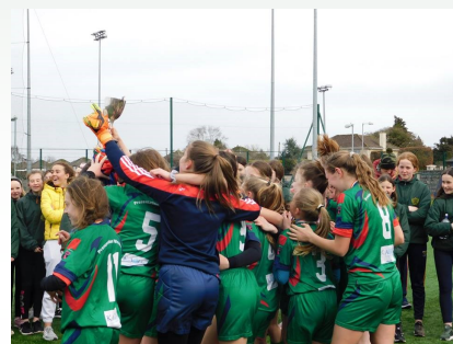
Leinster Champions! Our 1st Year Soccer team were crowned Leinster 'A' Champions this term!

Welcome to the Easter edition of our school newsletter. Thank you for taking the time to catch up with the major events from another busy term at Presentation Secondary School and we hope you all enjoy the break.