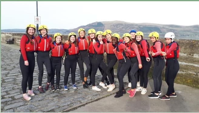
Transition Year students pictured at their annual trip to Carlingford Adventure Centre this term.